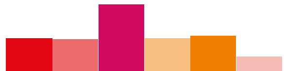
BUYER ATTENDEES BUYING POWER

See news stories and photos from IMEX America 2024 here