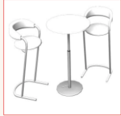
Bar Classic Package 2