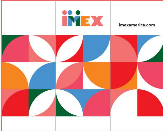
Each Shell Scheme booth wall is made of 3x 1m panels