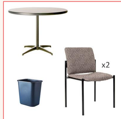
Chair Package A

All prices within this document are subject to change at the discretion of the service provider. Only prices at time of order placement are confirmed. All prices in USD unless otherwise stated. Tax not included.