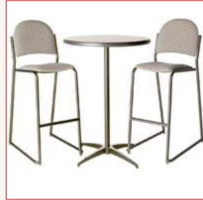
Furniture Package 2

Note - the Hardwall Booth package comes with the following free furniture: 1x Starbase Table (30" D x 40" H) 2x Padded Stools 1x Lockable Counter 1x Recycling Wastebasket 1x Waste Basket Carpet (5 colours to choose from)