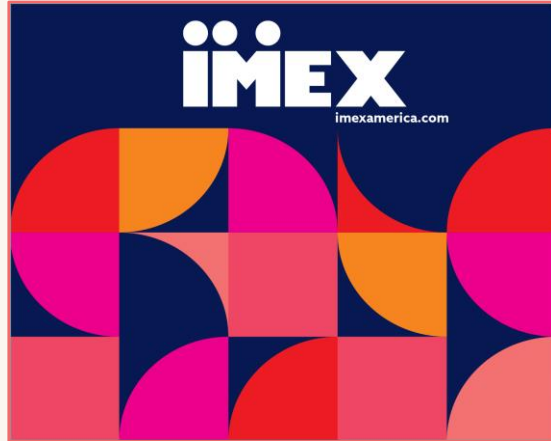
A 3m banner will cover a single 10ft booth wall