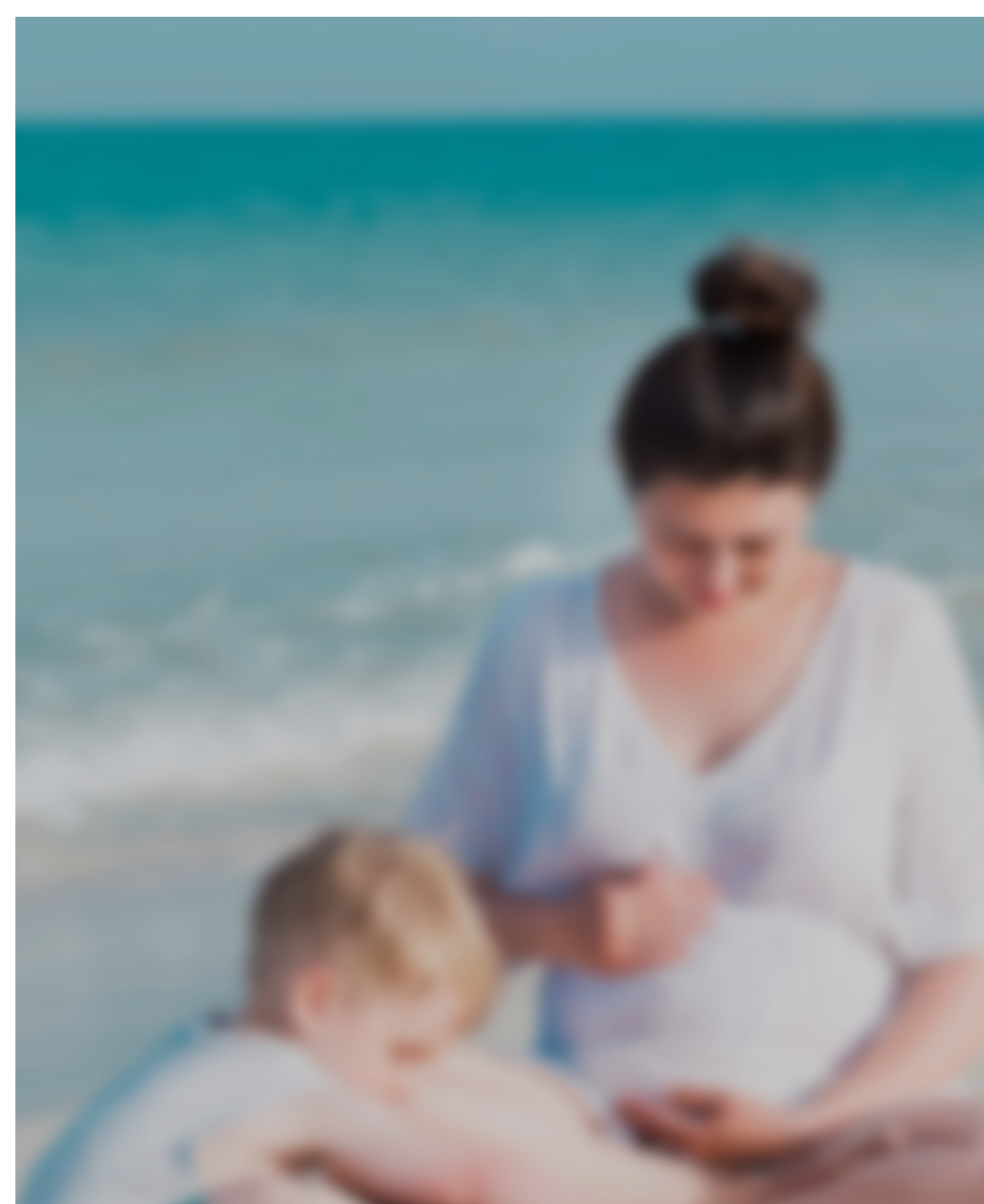
MOMMY & KIDS