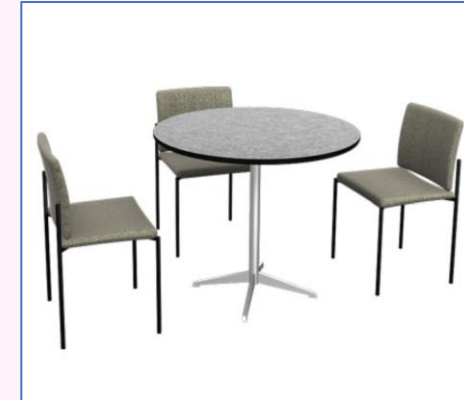
Chair Value Package 2

All prices within this document are subject to change at the discretion of the service provider. Only prices at time of order placement are confirmed.