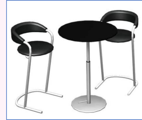
Bar Classic Package 1