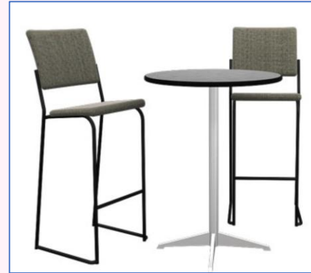
Bar Value Package 1

For further products and costs from GES, visit GES Expresso .