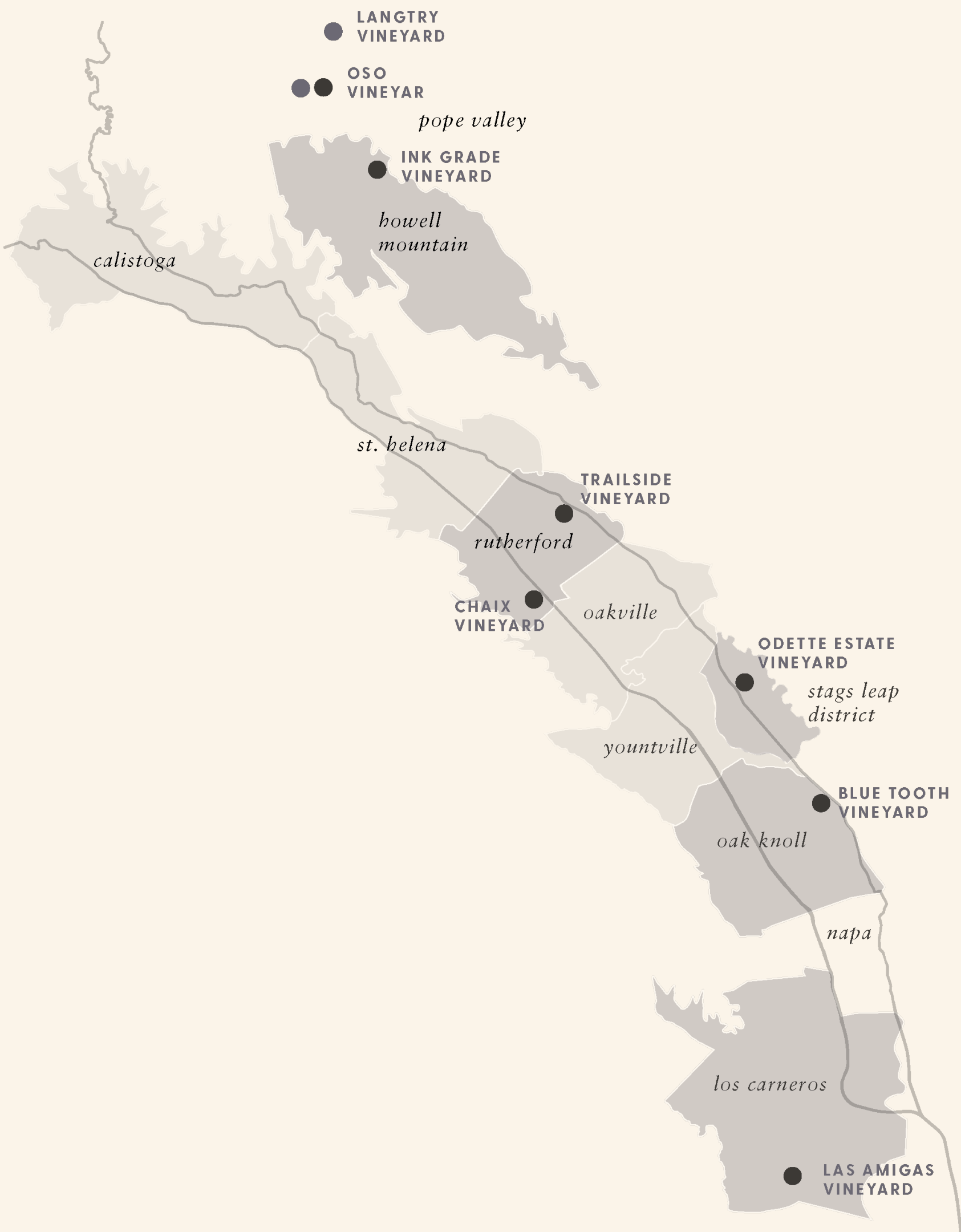
2019 Adaptation Cabernet Sauvignon, Napa Valley

We pride ourselves on producing wine that reflects the unique characteristics of the place from which it's grown. Carefully crafted at our LEED Gold Certified estate winery in the Stags Leap District, our Adaptation wines demonstrate the diversity and range within Napa Valley.